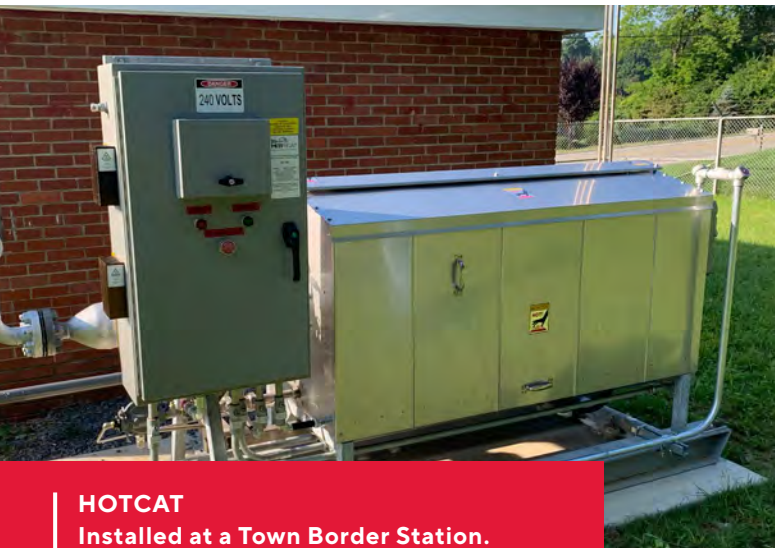
HOTCAT Installed at a Town Border Station. The silent operation, compact size & odor free characteristics are ideal for TBS.