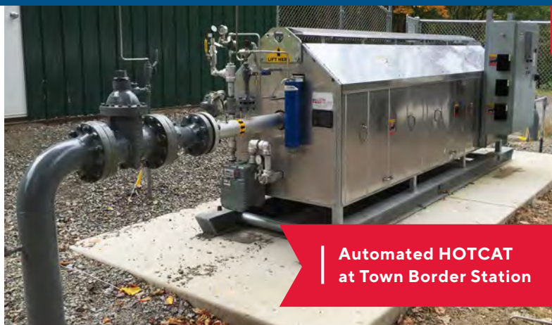
Automated HOTCAT at Town Border Station