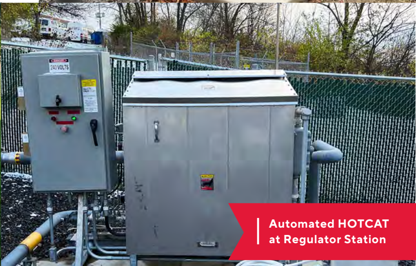
Automated HOTCAT at Regulator Station