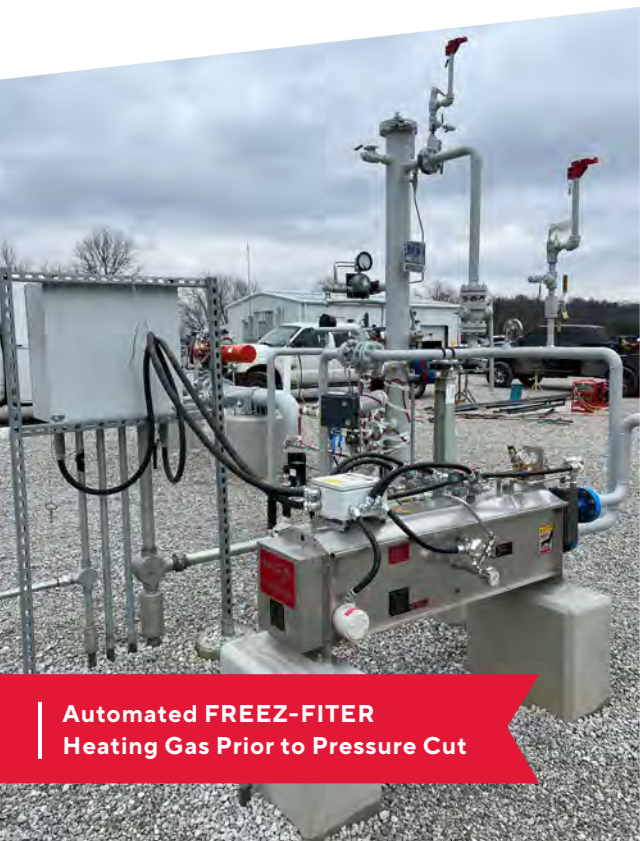
Automated FREEZ-FITER Heating Gas Prior to Pressure Cut